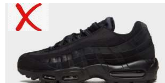
Trainers and branded.