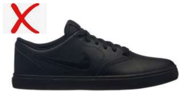
Trainers and branded.