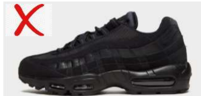
Trainers and branded.