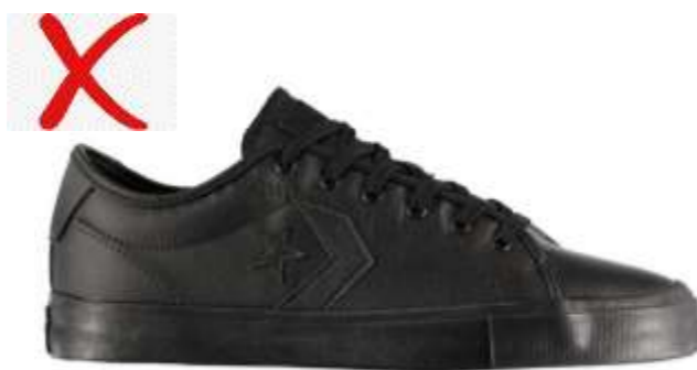
Trainers and branded.