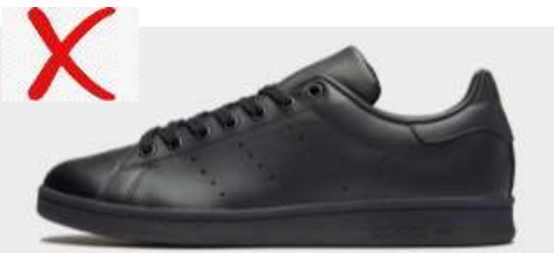
Trainers and branded.