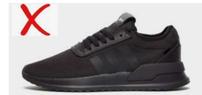
Trainers and branded.